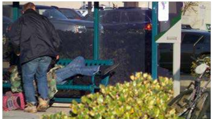
A homeless Lodi couple rests at a Cherokee Lane bus stop.