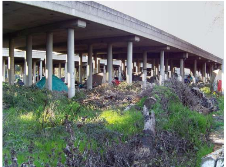
A homeless camp under Highway 99 in Lodi.