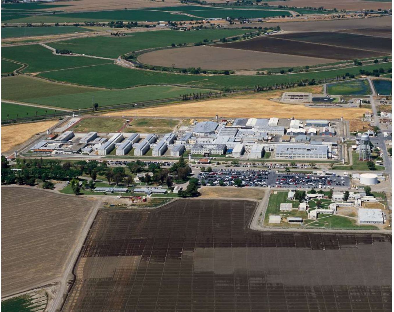
An aerial photograph of Deuel Vocational Institute looking north.

DVI has two missions: as a reception center that receives inmates from 29 Northern California counties; and to provide housing for general population inmates serving their incarceration at DVI. The facility also houses a small number of minimum- and low-security inmates classified by California Department of Corrections and Rehabilitation as levels I and II.