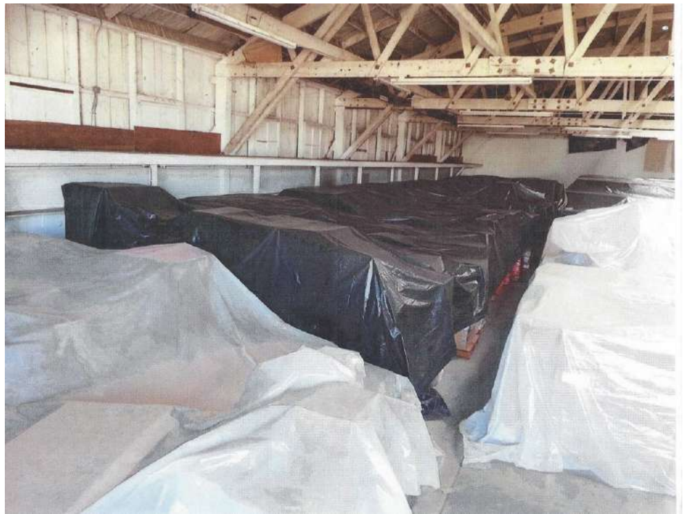
County election equipment and ballots protected by tarps in a hangar at the Stockton Municipal Airport.

Grand jurors were told the ballots in question were separated and isolated from all of the other ballots, were labeled and kept under