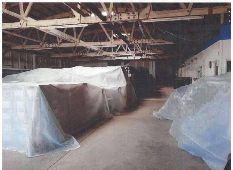
Tarps cover ballots and election equipment stored in a hangar at the Stockton Municipal Airport.

After the election, the ballots from the 2014 Gubernatorial Primary Election were stored in the ROV warehouse located near the Stockton Municipal Airport with security cameras strategically placed throughout. Because of a proposed increase in rent, San Joaquin County did not renew the warehouse lease in June 2015. This resulted in the ballots being moved to a less secure and leaky Stockton Airport hangar that ROV shares with other tenants and lacks video surveillance within the building.