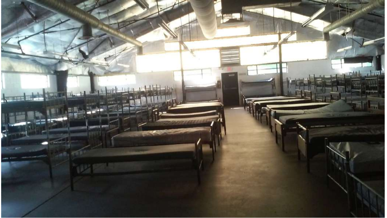
Beds in a day room at the Stockton Shelter for the Homeless.